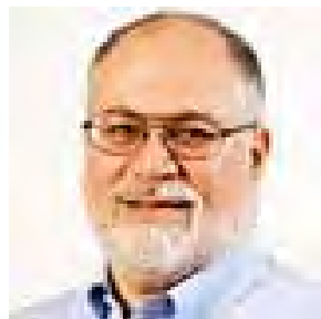
19 April 2016