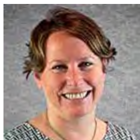
17 th PLMA Spring Conference